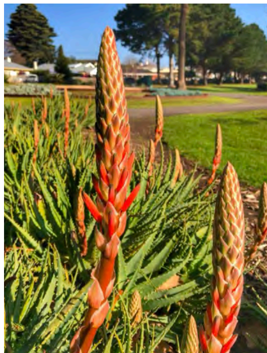
Aloe x spinosissima coming into flower. A very tough plant great for winter colour.